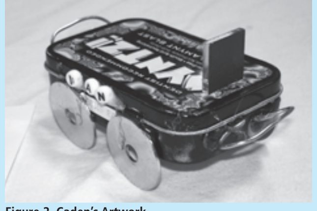
Figure 2. Caden's Artwork