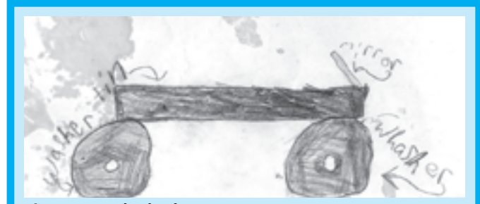
Figure 1. Caden's Plan

dent as Greyson worked. When asked whether her piece was going to be flat or stand up, Greyson replied, "I maybe wanted it to be tall." As she held the blue fabric she had selected for the shirt, she said, "I'm not sure what to do with this." Expressing her desire to work in three dimen-