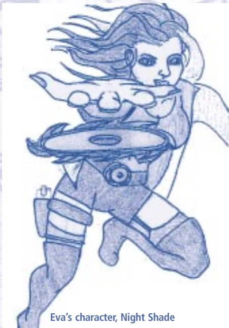
Eva's character, Night Shade

In her work on children's use of media and popular cultural symbols, Anne Dyson (1996) examines how young people's use of cultural symbols in their work reveals their view of the world and their values: “[C]hildren may position themselves within stories that reveal dominant ideological assumptions about categories of individuals and the relations between them—boys and girls, adults and children, rich people and poor, people of varied heritages,