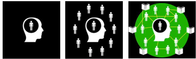
Figure 1 shows the disconnect of the data-centered librarian, who prioritizes the collection and then has to mediate between it and the public. Books, data, and resources—particularly those found in a library, where they are cataloged into a very specific order—represent organization. People represent chaos and destruction. This mindset explains why the first libraries were private. The elitism that controlled access to information prioritized resources over people. This mindset still motivates many in the field today.

Figure 2, by contrast, showcases the human-centered librarian: one who thinks first about patrons and connects them with the resources they need, including not only books, but also other people. A few lines in the diagram go straight from the librarian to a patron and no further. These lines represent services provided immediately to people in need, as the librarian administers Narcan to prevent a narcotic overdose, offers free lunches in partnership with a local food bank, or helps a job seeker with a résumé.