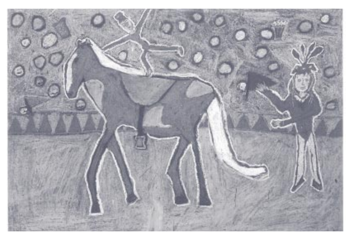
Maxine, grade 5, Brooklyn

n addition to helping children and teens feel better about who they are, practitioners leading after school theater workshops can create a moral climate in which individuals become