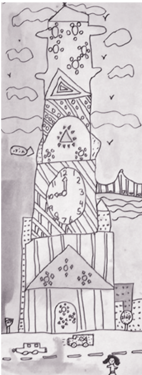
Studio in a School